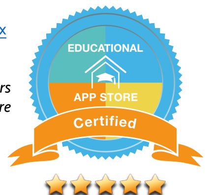
All other content © L-Pub GmbH

StoryPlanet English received the top score of 5 stars by the independent reviewers at Educational App Store